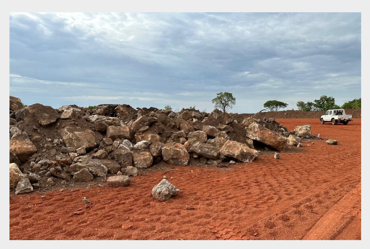
Ore stockpile, pre-crushing