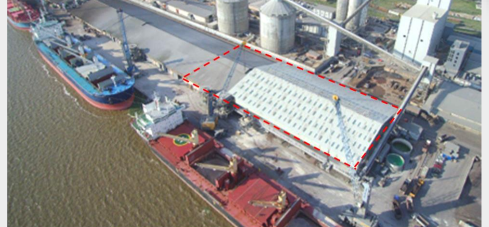
Abidjan Port bulk export loading facility and secured warehouse