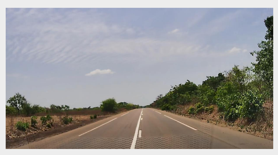
Typical road condition - Tingrela area, Côte d'Ivoire