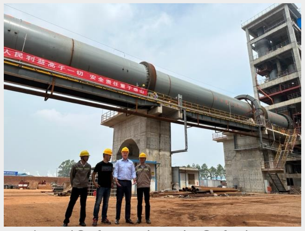
Leo and Ganfeng reps inspecting Ganfeng's new lithium hydroxide converter at Fengcheng, Jiangxi in May 2023

The agreement further cements Leo's very solid relationship with Ganfeng and creates numerous new growth channels for Leo.